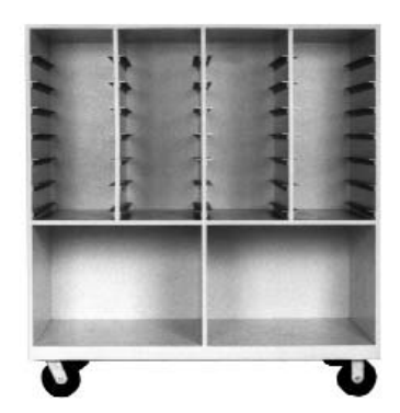
Items 880-950 to 880-952