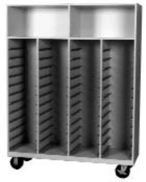
Items 880-963 to 880-970

Base Frame: Steel angle iron frame has four 6" dia.heavy duty casters (two fixed and two swivel with locks)