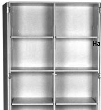
Half Open View