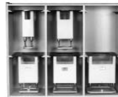
1830-36 Shown with Siemens Digital Cones

This unit must be secured to the wall with six screws. Included with the unit are brackets, screws and a bottom support board.