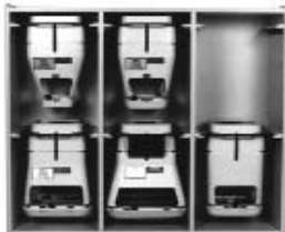
1830-26 Shown with Varian Type II Cones