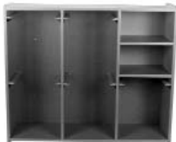
1830-25 or 1830-35