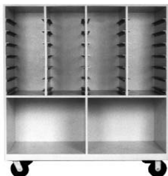
Items 880-950 to 880-952