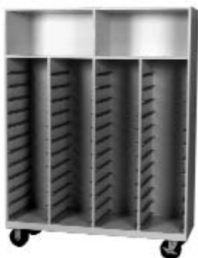
Items 880-963 to 880-970

Base Frame: Steel angle iron frame has four 6" dia. heavy duty casters (two fixed and two swivel with locks)