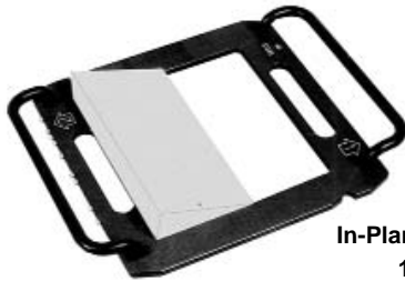
In-Plane Half Wedge 1881-030