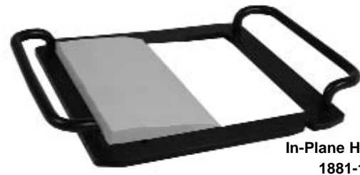
In-Plane Half Wedge 1881-130