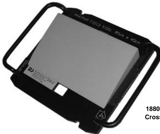
1880-9917 Cross Plane