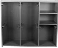
1830-25 or 1830-35