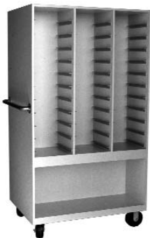
Item 880 904 thru 880-914

Note: Please specify which side for handle and swivel caster placement