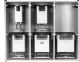
1830-36 Shown with Siemens Digital Cones

This unit must be secured to the wall with six screws. Included with the unit are brackets, screws and a bottom support board.