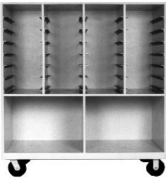
Items 880-950 to 880-952