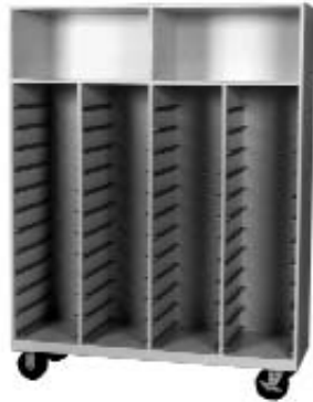
Items 880-963 to 880-970

Base Frame: Steel angle iron frame has four 6" dia. heavy duty casters (two fixed and two swivel with locks)