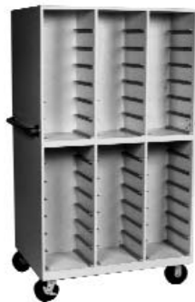
Item 880 920 thru 880-928