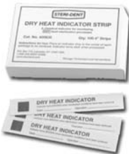
Dry Heat Indicator Strips

These self-sealing pouches are available in three sizes. For use in dry heat sterilization process only.