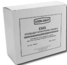
Spore Test Kits

These 4" (10.16 cm) strips are for use in dry heat processes up to 420°F. The indicator turns from green to brown. Insert in package or outside of package.