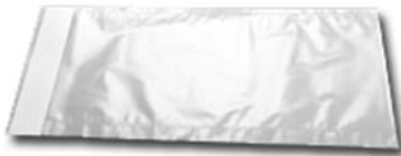
Nylon Dry Heat Sterilizing Pouches