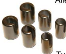
Optional Tungsten Shielded High Temperature Plastic Ovoid Caps