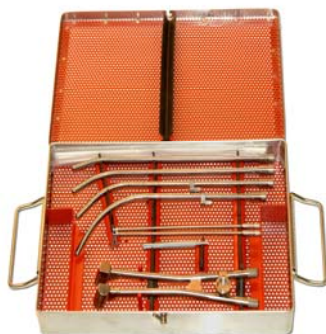
Applicator Set Item 970-550