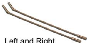
Left and Right Bucket Carriers