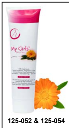
125-052 & 125-054