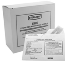
Spore Test Kits