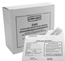
Spore Test Kits