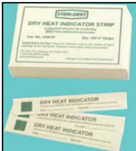
Dry Heat Indicator Strips

These 4" (10.16 cm) strips are for use in dry heat processes up to 420°F. The indicator turns from green to brown. Insert in package or outside of package.