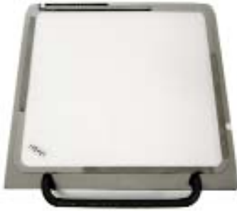
For use with Total Body Irradiation (TBI) Stands, Items 495-600 and 495-602.

The Radiation Physicist must find the projected isodose curves for their TBI Stand location.