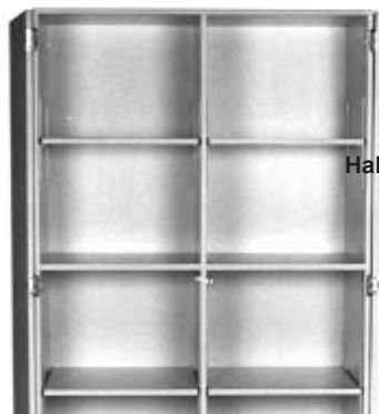
Half Open View