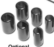
Optional Tungsten Shielded High Temperature Plastic Ovoid Caps