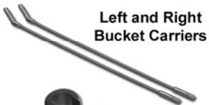
Left and Right Bucket Carriers