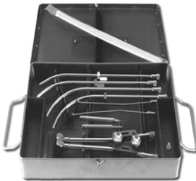
Applicator Set Item 970-553