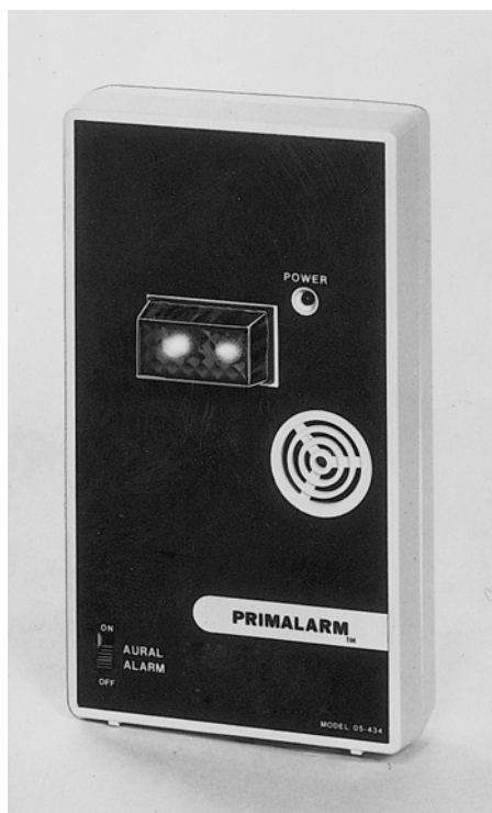
Figure 1-1 Primalarm 05-434

Primalarm 05-434 is a remote accessory which can be interfaced to a Primalert™ 10, 20, 35 or 50. The Primalarm is a remote alarm device, which, when connected to a Primalert, provides the same reset capability and audible/visual alarms as its measuring device.